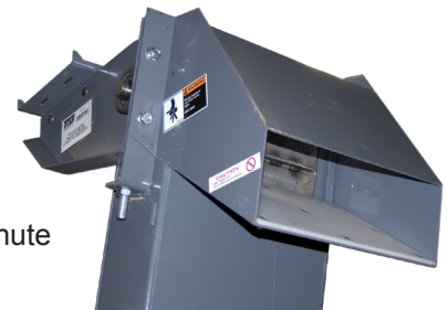
Special discharge chute