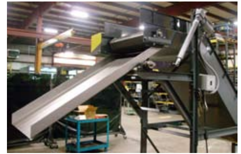
Special pneumatic chute for diverting material to specialized bins.