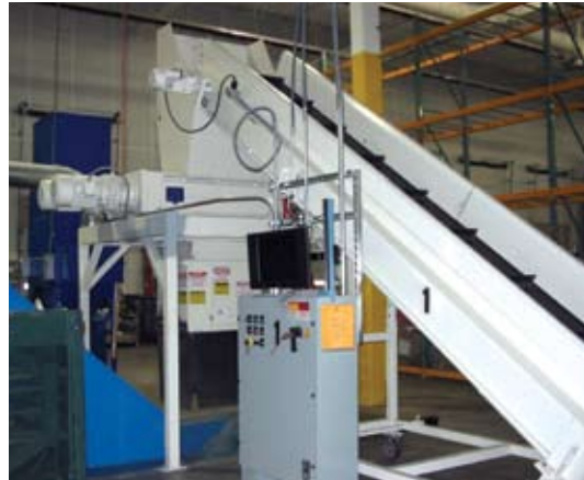
Model 340 transporting paper for shredding.