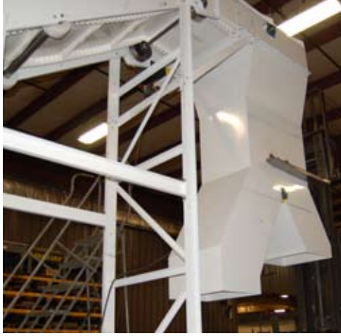
Special delivery chute for bulk material

Titan engineering will work with you to customize any standard conveyor to solve your bulk handling problems. Our innovative engineering will provide you with an economical and practical solution.