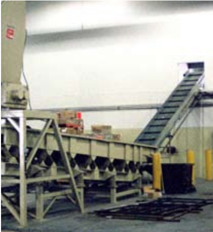
Model 340 - 460 system for delivery of bulk materials for shipping