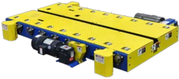
AGV system for assembly of marine engines