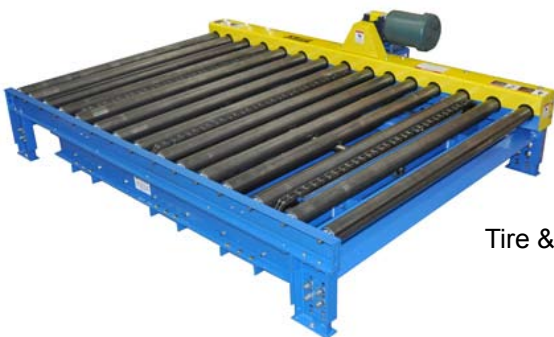
Tire & Wheel assembly line