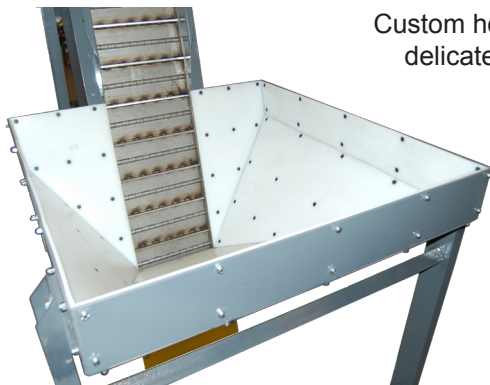
Custom hopper for delicate parts