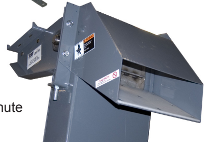
Special discharge chute