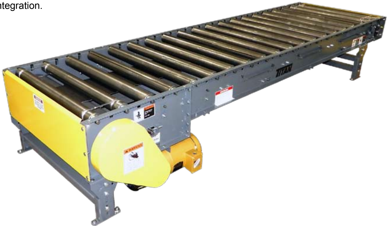
MODEL 408 BELT DRIVEN LIVE ROLLER CONVEYOR SPECIFICATIONS

When your application requirements dictate a heavier capacity Belt Driven Live Roller Conveyor , the selection should be a TITAN Model 408 . The 1.9" diameter x 16 gauge rollers are mounted in a formed 12 gauge frame and have the "lift out" feature that meets most safety requirements. The Model 408 features a heavy duty 8" diameter crown face rubber lagged (vulcanized) pulley with a 1 7/16" diameter drive shaft. Compression rollers are mounted on 6" centers. The compression roller brackets are supplied in 2' increments and mounted externally for quick access. All components used in the Model 408 are designed to be compatible with other TITAN equipment for interface and systems integration.