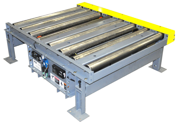
Motorized Roller Conveyor with 2-Strand Pop-up Chain Transfer