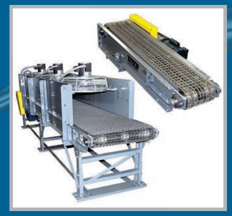
Wire Mesh Conveyors