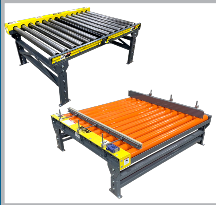
Motor Driven Roller Conveyors (MDR)