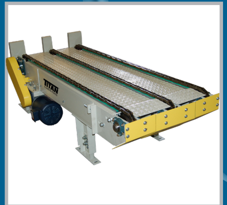
Multi-Strand Chain Conveyor