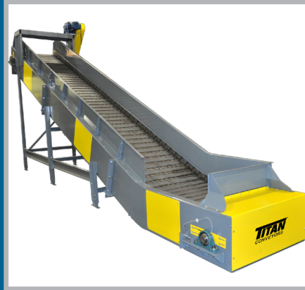
4", 6" Pitch Hinged Steel Belt