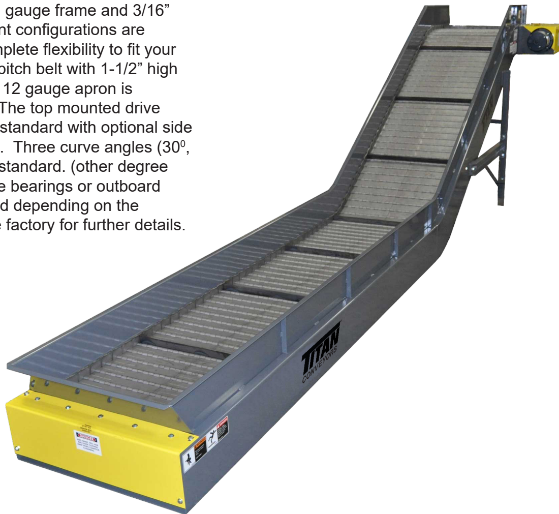
MODEL 630 - 2-1/2" PITCH HINGED STEEL BELT MODELS

The Model 630 Titan Hinged Steel Belt Conveyor is the full profile unit in our complete line of hinged steel belt conveyors. The Model 630 is constructed of 10 gauge frame and 3/16" thick track. Four different configurations are available to provide complete flexibility to fit your requirements. A 2-1/2" pitch belt with 1-1/2" high stamped sidewings and 12 gauge apron is furnished as standard. The top mounted drive with 8-1/2" clearance is standard with optional side mounted drive available. Three curve angles (30°, 45°, 60°) are offered as standard. (other degree curves optional). Marine bearings or outboard bearings can be supplied depending on the application. Consult the factory for further details.