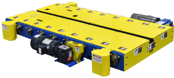
AGV system for assembly of marine engines