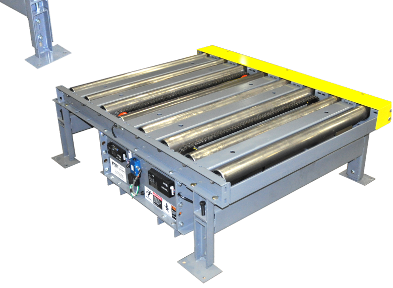
Motorized Driven Roller Conveyor with 2-Strand Pop-up Chain Transfer